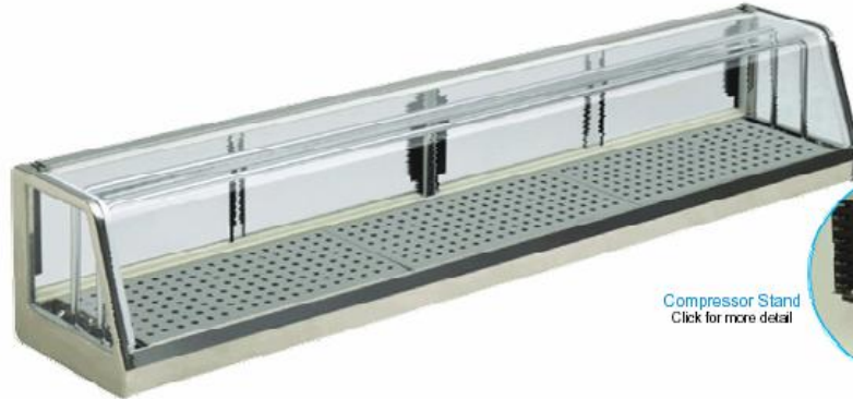
Compressor Stand Click for more detail